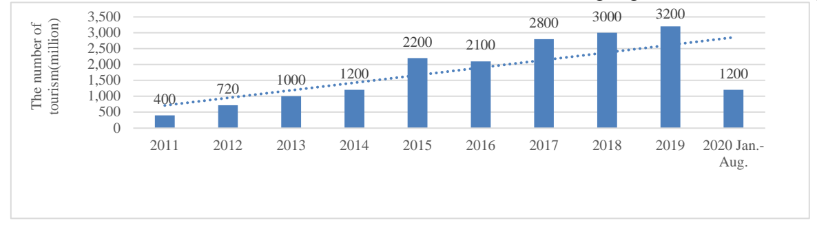
Figure 1. The Changes in the number of people receiving recreational agriculture and rural tourism in China from 2011 to 2020

houses is an important condition for the development of the vacation village housing model. Idle farm houses reduce the degree of work in the early stage of the project, facilitate asset transfer, and facilitate the renovation and upgrading of houses. Therefore, the resort mode generally chooses "hollow villages" or abandoned old villages after the relocation to new villages, which not only avoids the waste of idle resources, but also makes remote uninhabited ancient villages glow with new vitality.